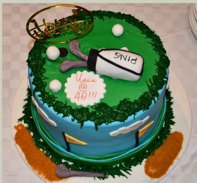
Unia@40 Tournament Celebration Cake.