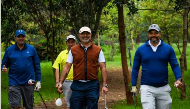
2022 VC's putter 4-ball on the move