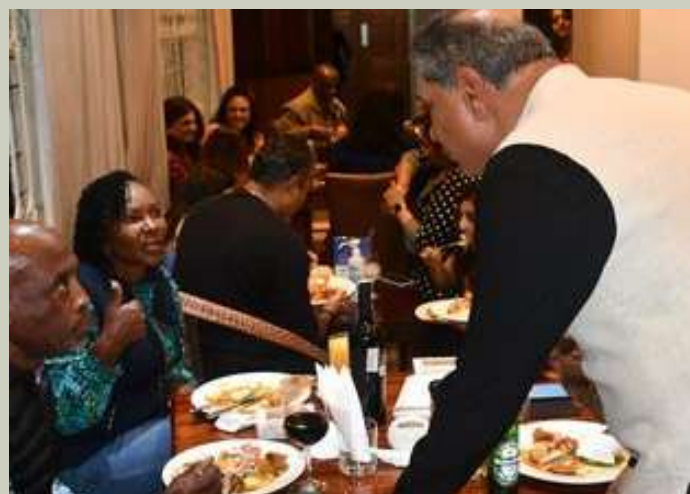
Diwali Golf Tournamnet Dinner.