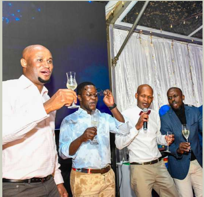
Because birthday's are better celebrated with friends, they had to show up.