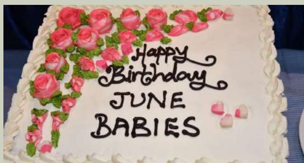
June Birthday Cake.