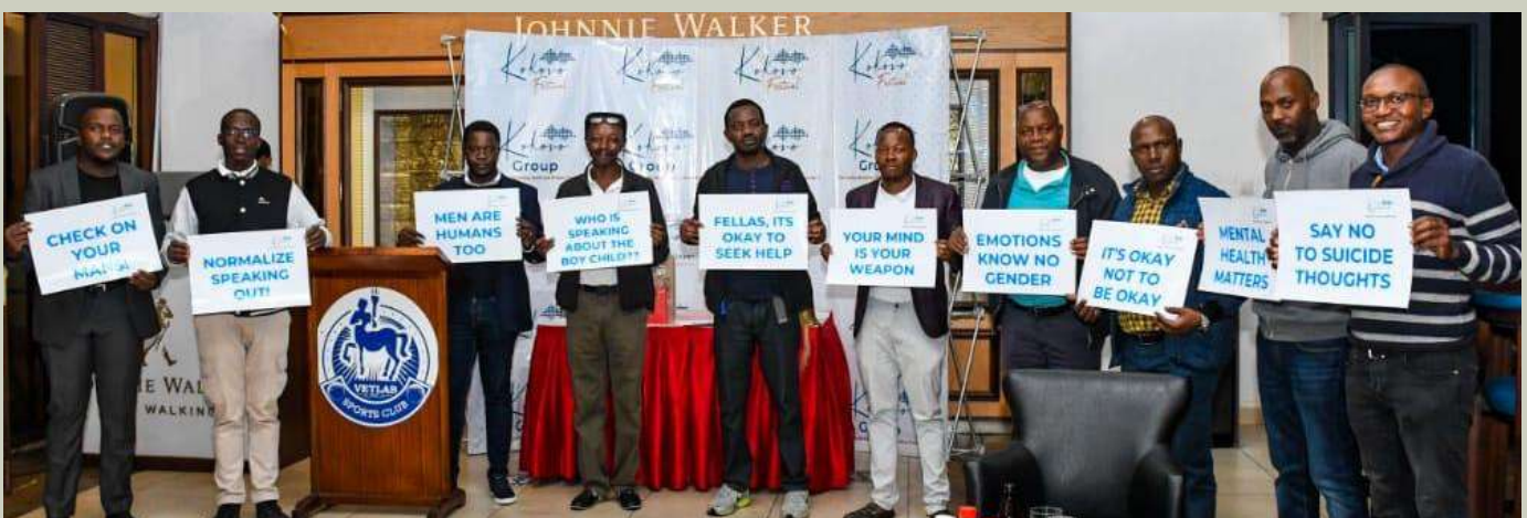
Vetlab Members speak up for the Boy Child during the Movember Golf Tournament.