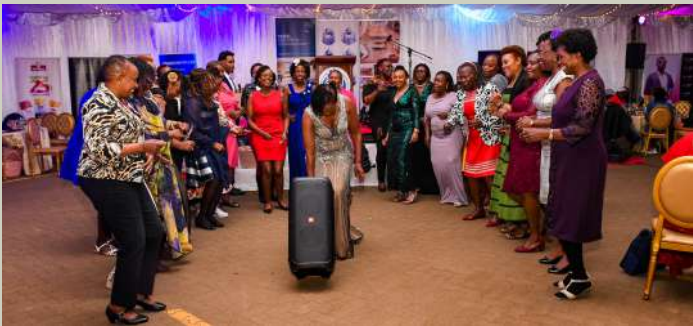
Lady Captain receives a powerful boom box from Kabete Ladies since she is a party lover.