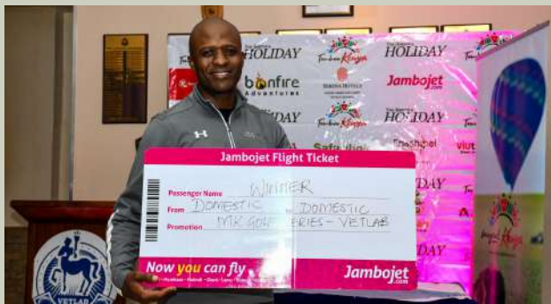
Magical Kenya Golf Day winner shows off his Ticket.