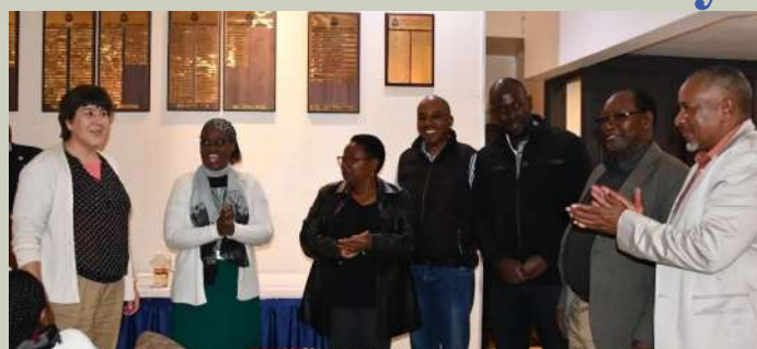
June Vetlab Members Birthday Cake Cutting.