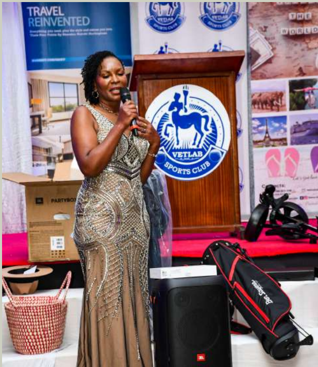
Lady Captain expressing her gratitude for the gift.