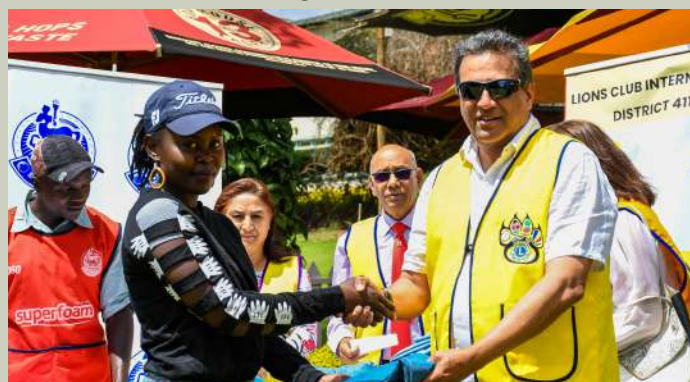
A caddy receives a gift during the Lion's District CSR.