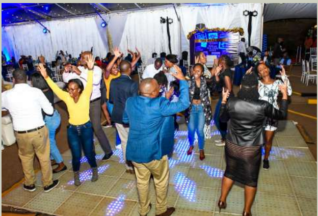
Party after party it was for members.