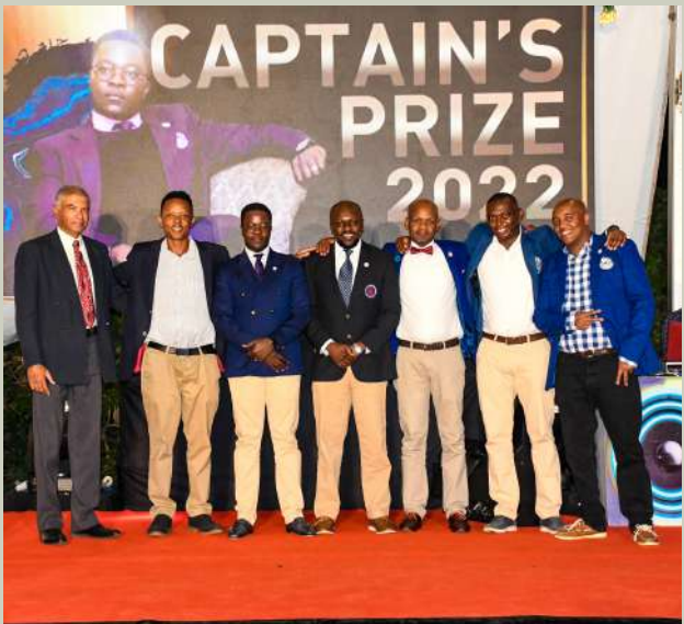
Former Captain's who showed up in support of Captain Akun.