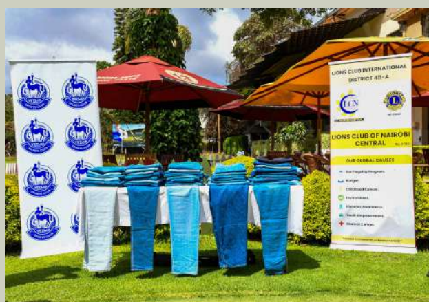
Lion's District CSR at Vetlab Sports Club.