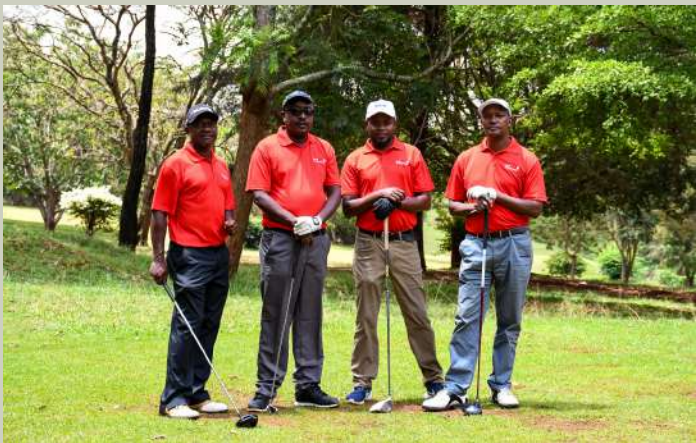
V-Power branded 4-ball during the 2022 Captain's prize.