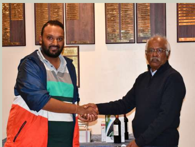
Unia@40 Golf Tournament Winner