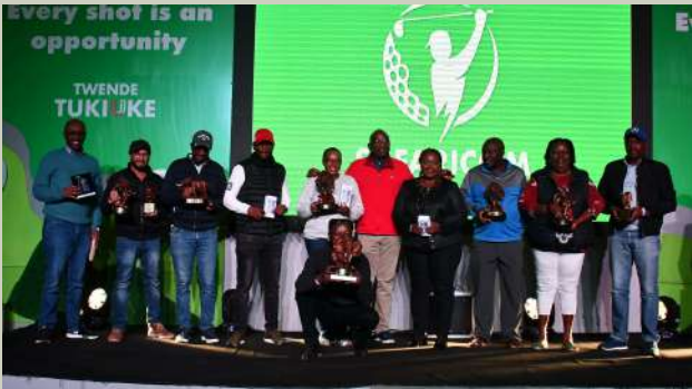
2022 Safaricom Tour Vetlab Leg Winners.