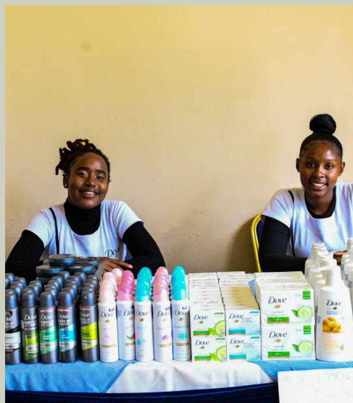
2022 VC's Putter Dove's Set up