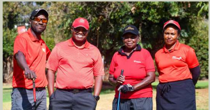
These lovely 4-ball also dressed up for the theme on the course.