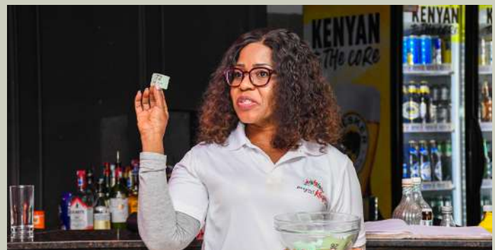
One of the Magical Kenya Officials running a raffle during the dinner party.