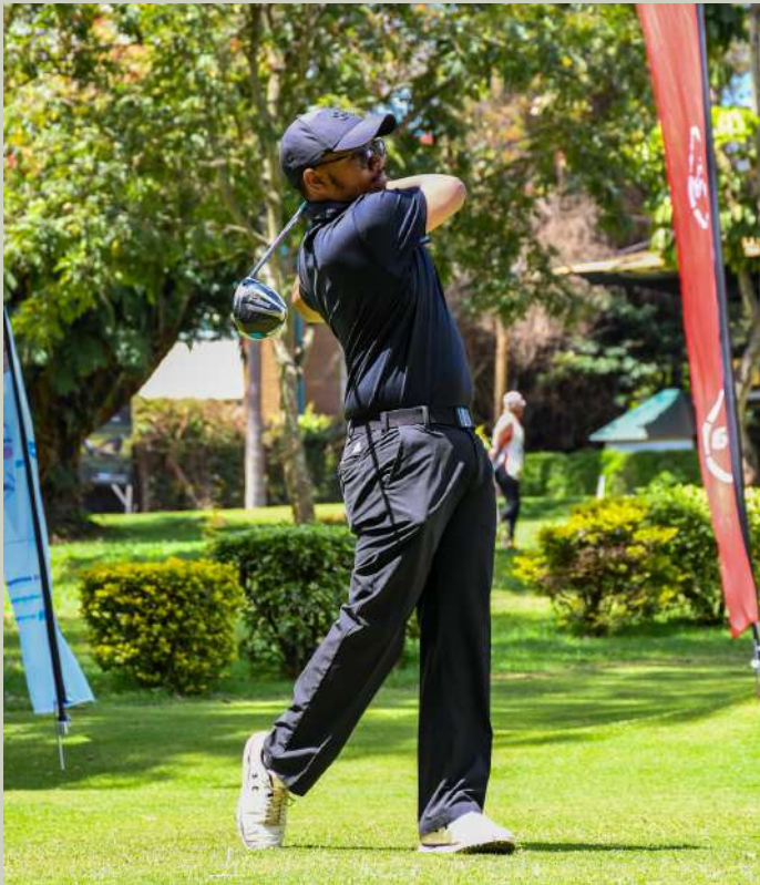
2022 VC's Putter winner's swing that led to his win