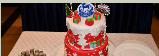
December Birthday Cake.