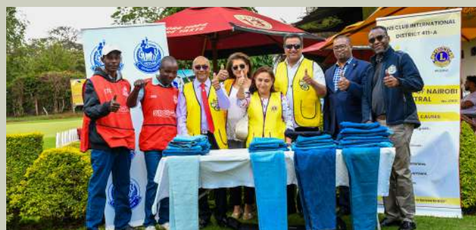
Cheers to good partnerships, good initiatives.