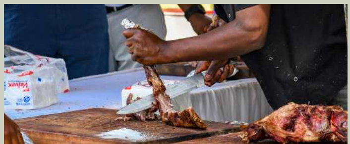
Nyama choma on the course during the 2022 Captain's Prize.