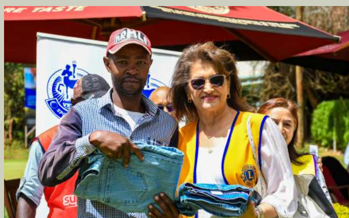
Lion's District official gifting a caddy during the Lion's District CSR.