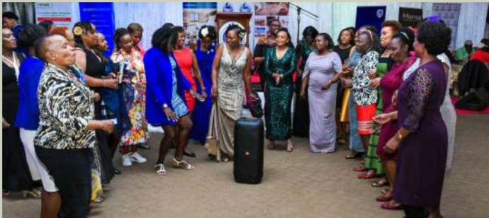
The Kabete Ladies dancing with the lady captain after she received her gift.