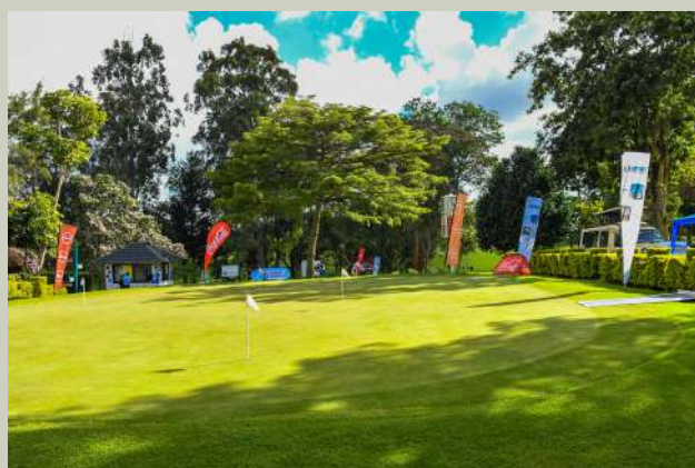
2022 VC's Putter sponsors