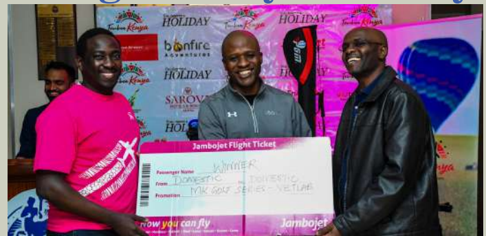
Magical Kenya Golf Day Overall winner receiving his prize.