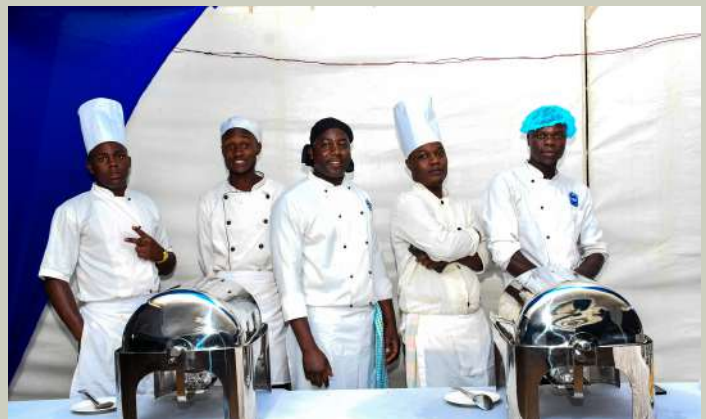
The team that made sure you were not on empty stomach's during Bakun's party.