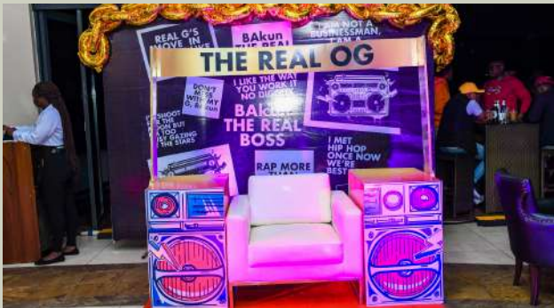
The guy from the lake side Friday Party Set up