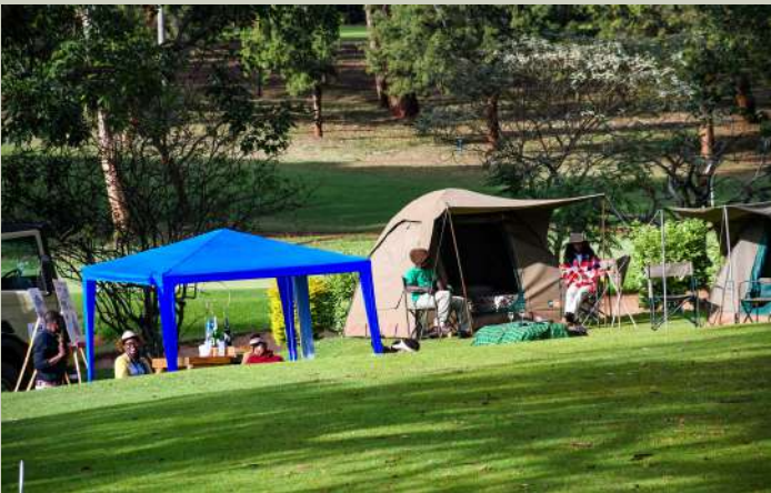
Sense of Africa Set Up during the 2022 Captain's Prize.