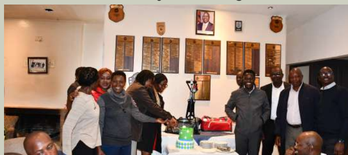
November Vetlab Members Birthday Cake Cutting.