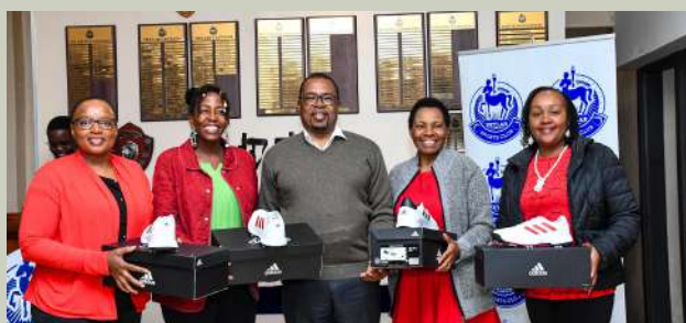
The Journey to 100 Years Launch Golf Tournament Winners.