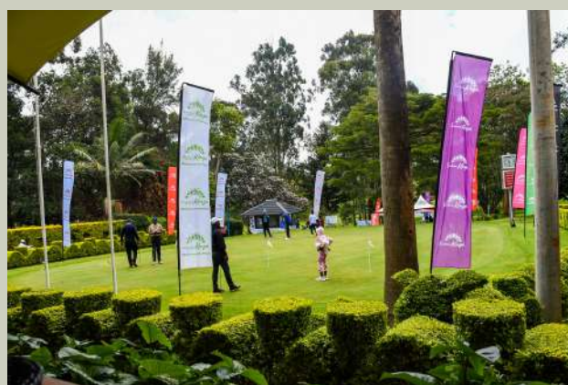
Magical Kenya Golf Day at Vetlab Sports Club Sponsors.