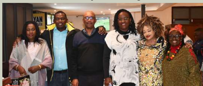
July Vetlab Members Birthday Cake Cutting.