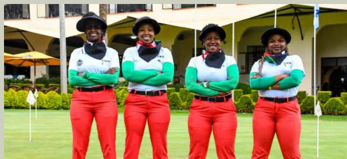
Journey to 100 Years Launch Golf Tournament best dressed team on the course.