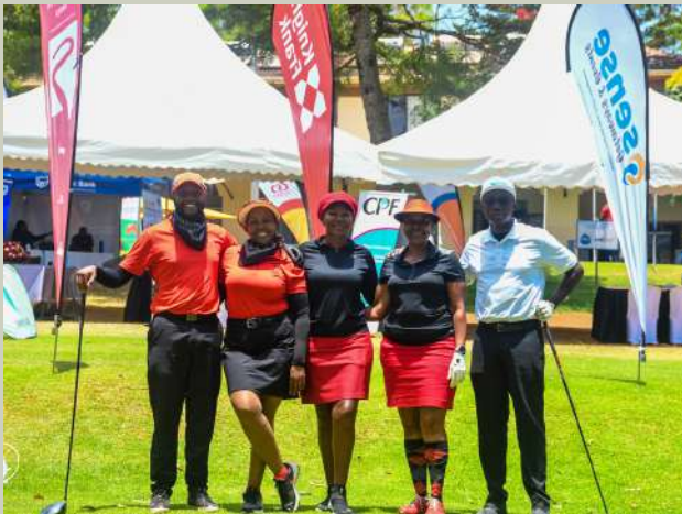
2022 Lady Captain(center) and her 4-ball.