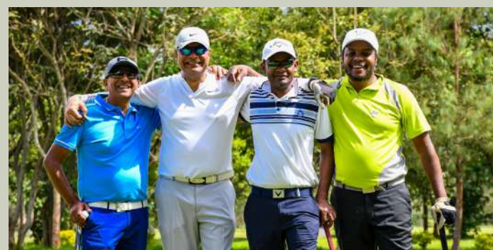
The Journey to 100 Years Golf Tournament supporters on the course.