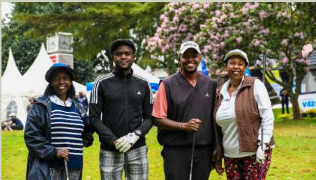
Even Hon. Martha Karua (Left) could not afford to miss the 2022 Captain's Prize.