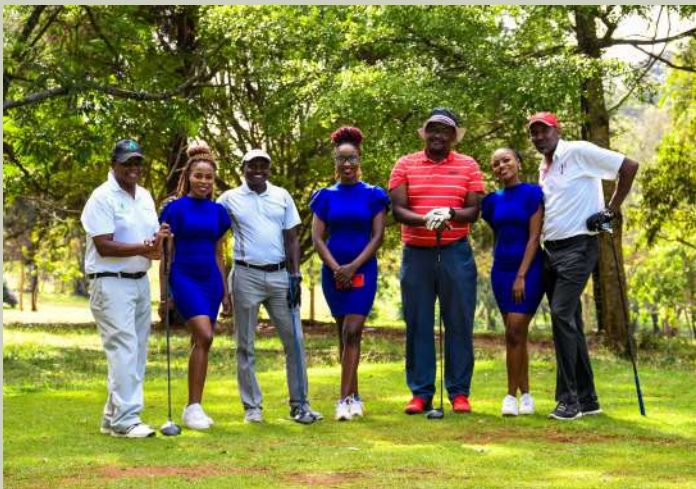
The ladies made sure members had a good experience on the course with their beautiful smiles.