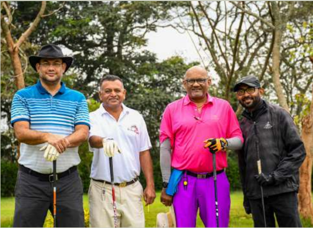
A 4 ball poses for a photo during the 2022 Vice Chairman's Putter