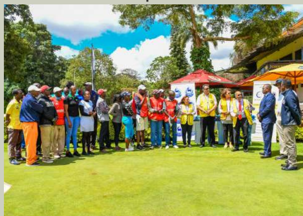
Lion's District Officials, Vetlab's Leadership, and caddies during the CSR Activity.