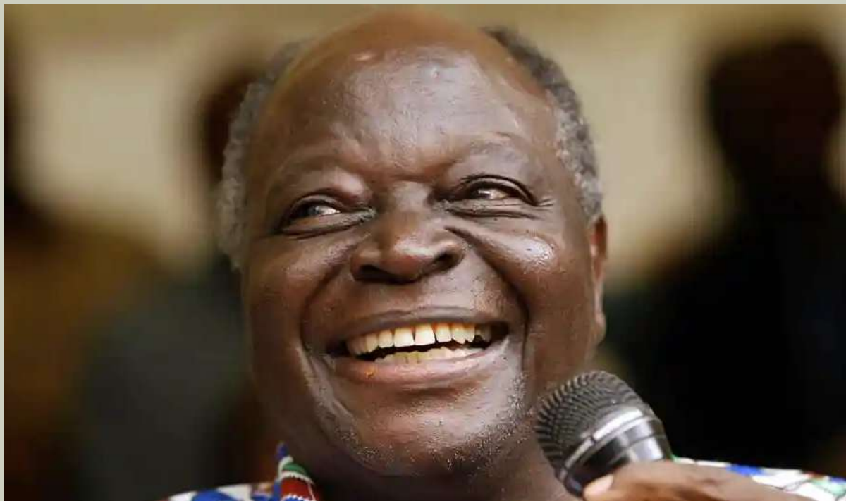
H.E Emilio Stanley Mwai Kibaki CGH