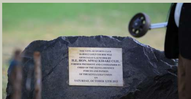
The Mwai Kibaki Monument for officiating the launch of Vetlab as an 18-hole course.