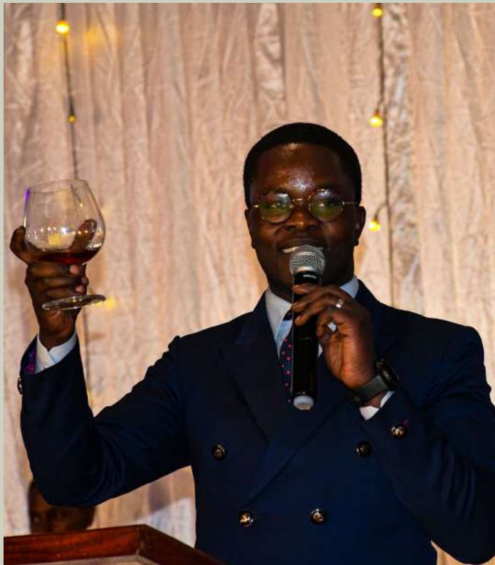
The famous Captain's toast to mark the end of a party could not go unnoticed.