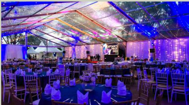
2022 Captain's Prize Dinner Set Up.