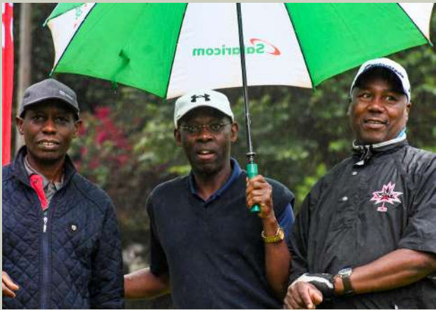
Not even the rains could keep off members from having a good round of golf.