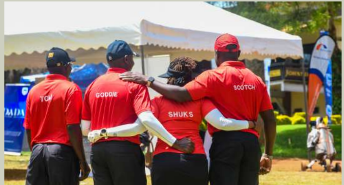
A lovely pose from a 4-ball during the 2022 Lady Captain's Prize.