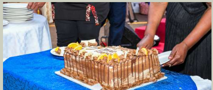
2022 Lady Captain's Prize Cake.