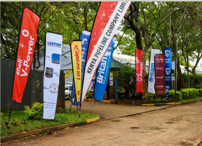
2022 Captain's Prize Sponsors.