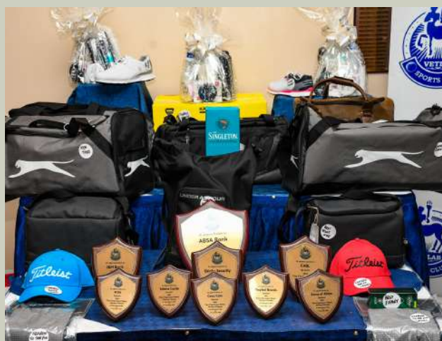
VC's Putter Prizes and Awards