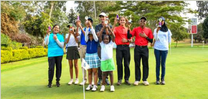
2022 Captain's Prize Brian Akun Junior Tournament Winners.