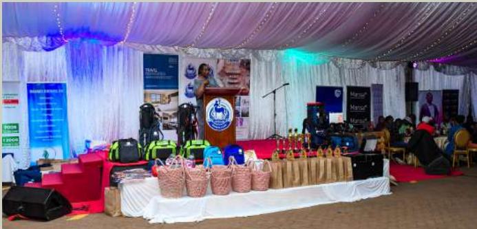
2022 Lady Captain's Prize prizes.