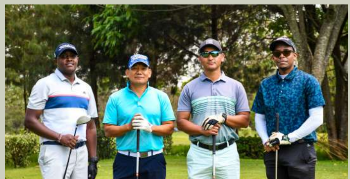
A 4- ball on the course during the Magical Kenya Golf Day.