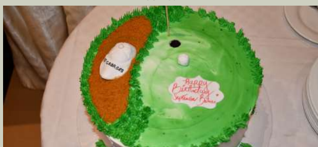
September Birthday Cake.