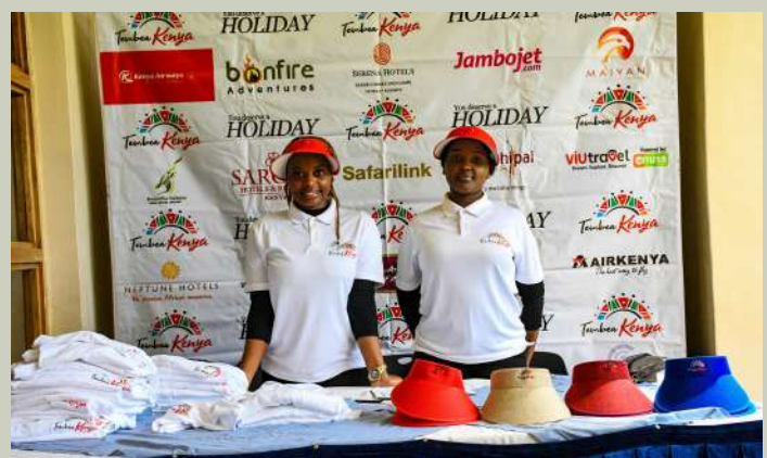
Magical Kenya Stand during the Magical Kenya Golf Day.