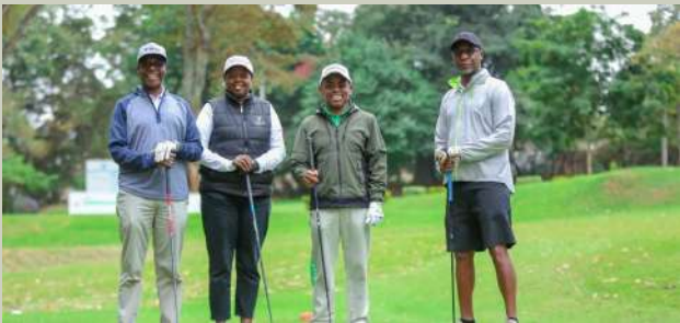
Safaricom CEO (Second from right) and his 4 ball during the safaricom golf tour, Vetlab leg.