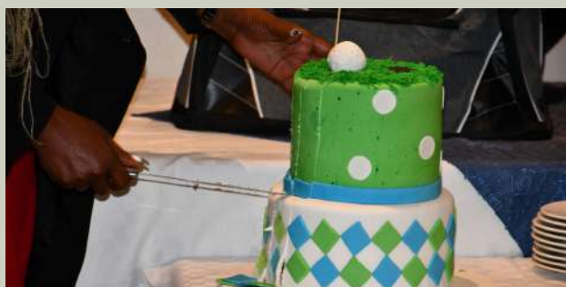
November Birthday Cake.