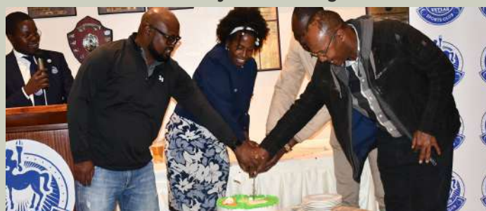
September Vetlab Members Birthday Cake Cutting.