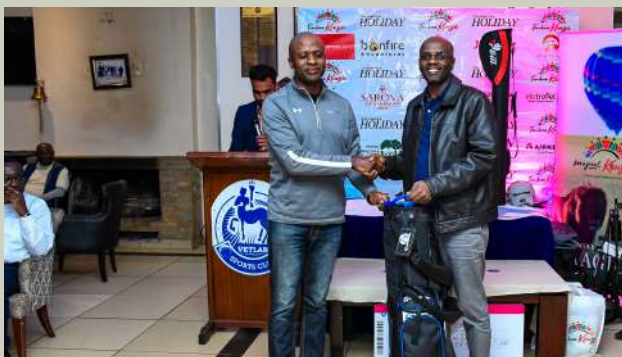
Magical Kenya Winner receives a brand-new golf bag after his win.