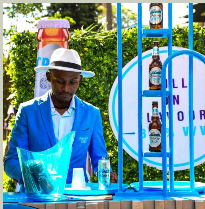
2022 VC's Putter EABL Set up