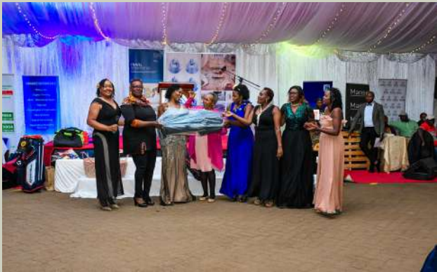
Kabete Ladies appreciates the lady captain with a new travelling bag after learning she was planning to get one for her trip after her event.