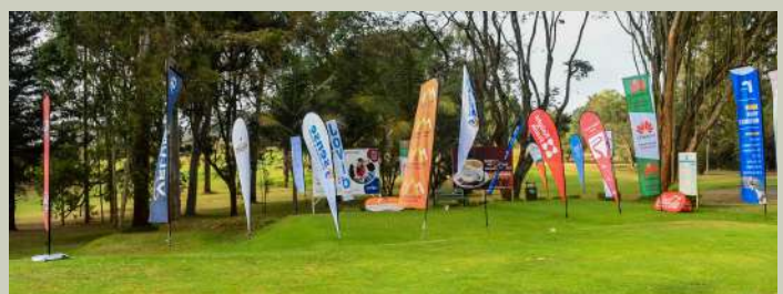
2022 Lady Captain's Prize sponsors.