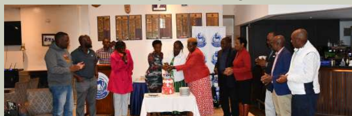
December Vetlab Members Birthday Cake Cutting.