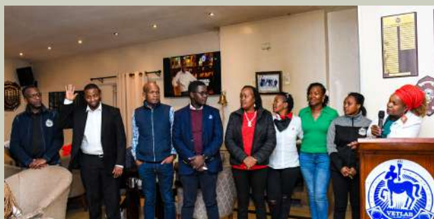
The Journey to 100 Years Golf Tournament Organizing Committee.