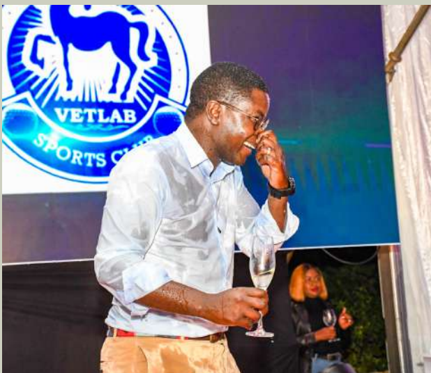
And because it was the eve of the Captain's birthday, tradition has it that he showed have soaked.