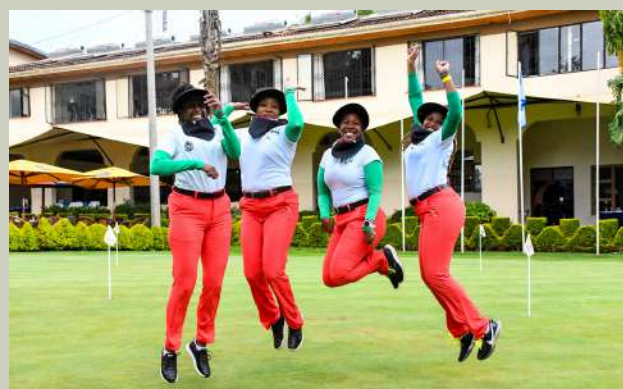
Journey to 100 Years Launch Golf Tournament best dressed team on the course having a moment of fun.